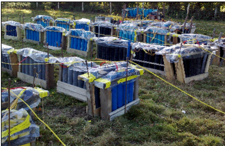
Mortar racks fused and ready to go.

Delay - CBS use delay fusing which burns at about one inch per second. Placed at the start of a quick match chain to allow delayed ignition of a series of fireworks in our barrages, set pieces and mortar displays, this allows the operator to retire to a safe distance.